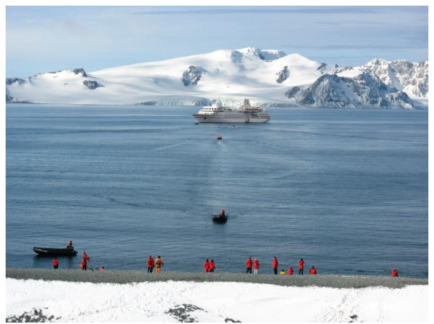
Fig. 20: Landing in Half Moon Bay, Antarctic Peninsula (Photo by Cornelia Lüdecke, 27 February 2007).

However, decreasing numbers of tourists landing in Antarctica indicate that tourists are unlikely to overflow Antarctica any time soon (Tab. 2).