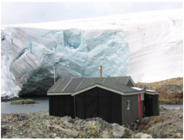
Fig. 14: Wordie House on Winter Island (Photo by Cornelia Lüdecke, 1 March 2007).

At other places tourists can enter historic huts like the museum at Port Lockroy or Wordie House established as British Base "F" in 1947 on Winter Island, one or the Argentine Islands at the Antarctic Peninsula close to Ukraine's Vernadsky station (Fig. 14)<sup>21</sup>.