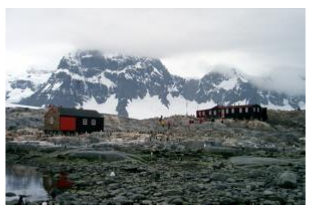
Fig. 2: A Gentoo penguin colony at the museum in Port Lockroy (Photo by Wilfried Korth, 4 February 2004).

Figure 3 shows the increase of shipborne tourists and the number of cruise ships and sailing vessels. In fourteen years Antarctic shipborne tourism increased by 430% while land-based tourists rose by 757% in the last decade<sup>6</sup>.