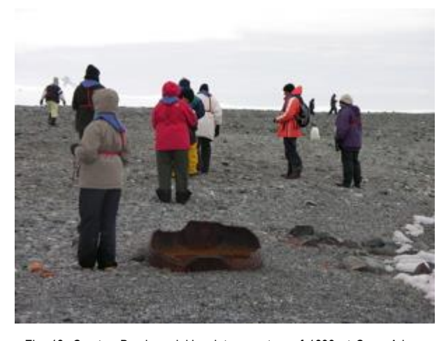
Fig. 13: Carsten Borchgrevink's winter quarters of 1899 at Cape Adare, Ross Sea, Antarctica.

In contrast to these sites, old huts from the heroic era of polar research are much easier to identify. Sometimes access is prohibited by surrounding penguin colonies as can be seen in Figure 13.