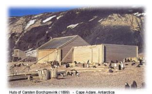
Fig. 11: Try-works at Yankee Harbour (Photo by Maria Ximena Senatore, January 2006)

If tourists go ashore, they are instructed to pay special attention to historic sites. They are not to step on relics or to enter old huts unless specifically authorized to do so. However, they often do not realize that stones arranged in certain pattern are considered part of the sites. This happens at sealing sites established in the early nineteenth century at places like Yankee Harbour on the southwestern part of Greenwich Island close to Bransfield Strait, where people are allowed to handle the try-works (cast-iron pots) from the sealing era (Fig. 11)<sup>19</sup>.