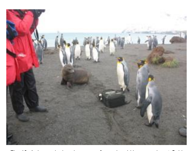
Fig. 10: A day pack placed among a fur seal and king penguins at Gold Harbour on South Georgia (Photo by Cornelia Lüdecke, 9 March 2007).

But what about the small alien species that tourists may carry from one Antarctic landing site to another on their clothing or other items that are not cleaned after they return to the ship? (Fig 10).