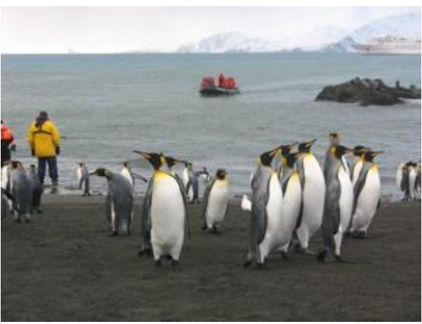
Fig. 7: Landing in Gold Harbour on South Georgia although the shore is occupied by king penguins (Photo by Cornelia Lüdecke, 9 March 2007).