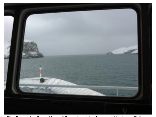
Fig. 5: Leaving the caldera of Deception Island through Neptunes Bellows (Photo by Cornelia Lüdecke, 2 March 2007).

Tourists feel exhilarated when they finally approach the Antarctic continent after passing through the usually rough Drake Passage between South America and the Antarctic Peninsula. Deception Island in the South Shetlands is one of the first stops. Entering the caldera through the narrow passage called Neptunes Bellows is a special highlight of every cruise (Fig. 5). Before tourists make their first landing, expedition leaders and tour guides inform them of the guidelines for proper conduct, per the criteria established by IAATO<sup>12</sup>.