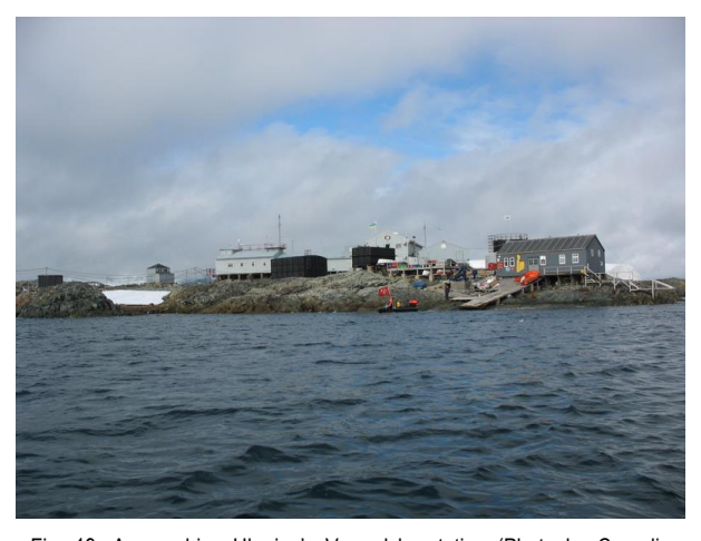
Fig. 19: Approaching Ukraine's Vernadsky station (Photo by Cornelia Lüdecke, 1 March 2007).

Another example is the current Vernadsky Research Base on Galindez Island adjacent to Wordie House on one of the Argentine Islands<sup>30</sup>. Ukraine took over the former British Faraday Station in 1996, which was built to replace Wordie House in 1954. Tourists can visit the station on tours guided by the Ukrainian personnel (Fig. 19).