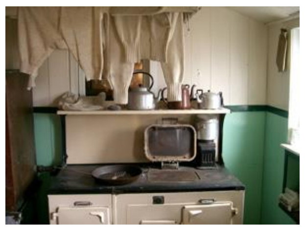
Fig. 18: Kitchen of the old research station in the museum at Port Lockroy (Photo by Wilfried Korth, 2004).

monitor their impact on penguins, which seems to be positive, since tourists decrease the prevalence of skuas, which like to take penguins eggs and chicks<sup>29</sup>.