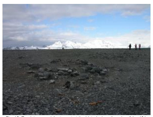
Fig. 12: Tourists around the try-pot at the historical sealing site of the 19th century at Yankee Harbour (Photo by Maria Ximena Senatore, January 2006).

Most of the changes at the sites were due to nature, when wind partially covers the stone settings with sand one year and exposes them in another. Extensive archaeological research of historical whaling sites from the 18<sup>th</sup> and 19<sup>th</sup> century was conducted at Byers Peninsula of Livingstone Island<sup>20</sup>.