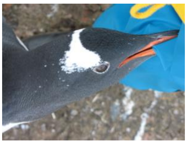
Fig. 9: A curious gentoo penguin tries the trousers of a guide at Aitcho Island (Photo by Cornelia Lüdecke, 3 February 2007).

John Shears reported that the impact of tourists on the Gentoo penguin colony at Port Lockroy is only minimal due to proper management and control, although the area is heavily visited 15. If tourist groups are properly guided these encounters do not pose a serious threat to the wildlife.