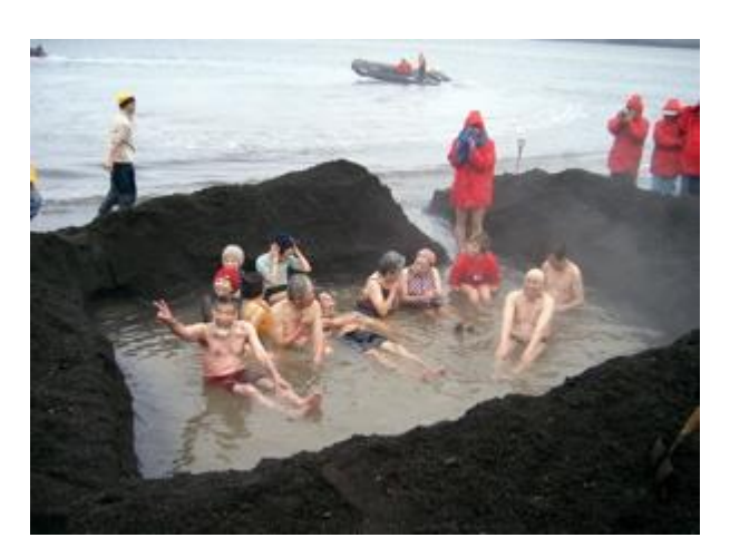
Fig. 6: Japanese tourists taking a bath on the shore of Deception Island at Whalers Bay (Photo by Wilfried Korth, 3 February 2004).

Tourists are allowed to go ashore only after agreeing to follow these guidelines. At Whaler's Bay on Deception Island they see the remains of an old whaling station that was destroyed by volcanic eruptions in 1927. They then continue to a research station of the British Antarctic Survey which includes a small landing strip and aircraft hangar. Penguins and seals serve as additional points of interest in the largely abandoned area. Due to the volcanism special activities are offered on the shore of Whaler's Bay. Crew members dig a pool in the sand, and it quickly fills with hot water. Tourists are allowed the bathe therein, which makes for a memorable experience given the cold weather and frequent snowfall (Fig. 6).