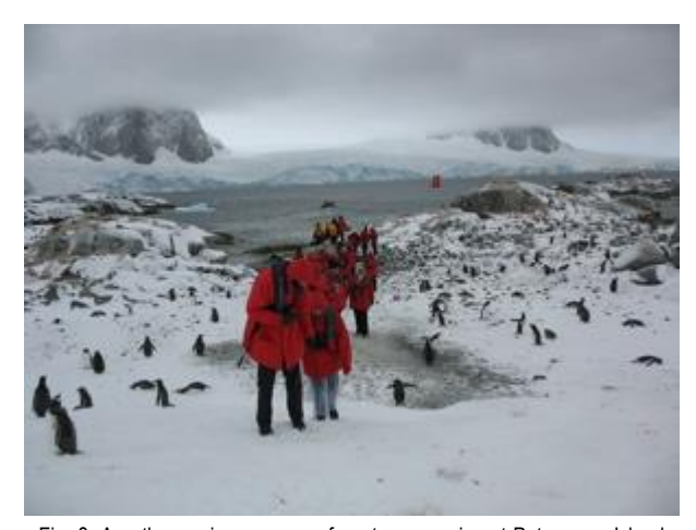
Fig. 8: A path crossing a group of gentoo penguins at Petermann Island (Photo by Cornelia Lüdecke, 3 March 2007).

Sometimes tourists are unable to maintain the proper distance because they are approached by curious penguins (Fig. 9).