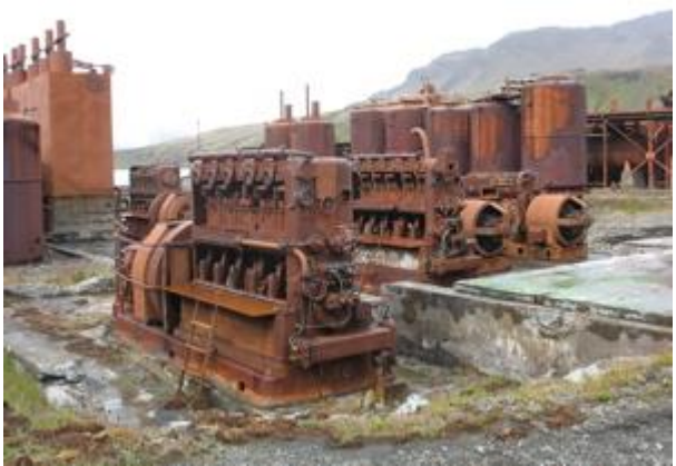
Fig. 17: The former whaling station Grytviken after a clean up (Photo by Cornelia Lüdecke, 7 March 2007).

The result of such a strict clean up can be seen at the historic whaling station of Grytviken established in 1904 on South Georgia (Fig. 17).