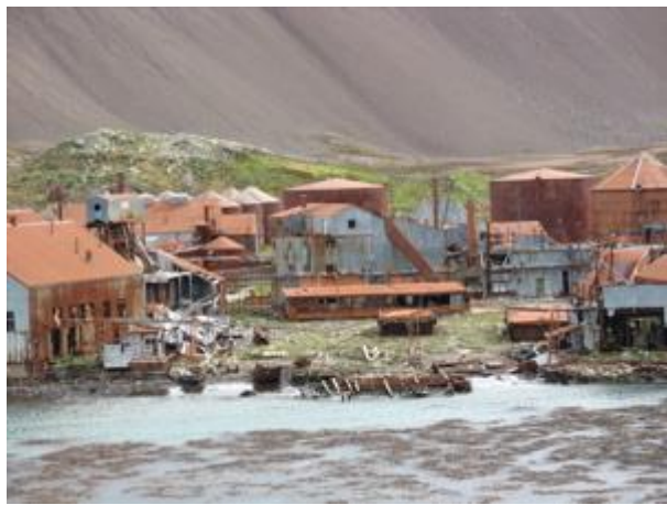
Fig. 16: The former whaling station Leith Harbour at South Georgia still seems to be full of rubbish (Photo by Cornelia Lüdecke, 7 March 2007).

The result of such a strict clean up can be seen at the historic whaling station of Grytviken established in 1904 on South Georgia (Fig. 17).