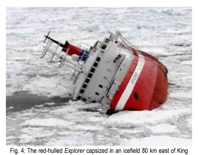
George Island on 23 November 2007.

On 23 November 2007 the first Antarctic cruise ship MS Explorer operated by Lindblad Expeditions sank in the Bransfield Strait, about 80 km east off King George Island after a collision with an iceberg<sup>9</sup>. See figure 4.