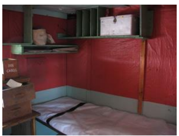
Fig. 15: Bed and private corner in Wordie House on Winter Island (Photo by Cornelia Lüdecke, 1 March 2007).

Today Wordie House is restored and designated under the Antarctic Treaty System as Historic Site and Monument No. 62. Tourist groups can visit on request (Fig. 15)<sup>22</sup>.